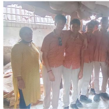
A visit to Dharavi