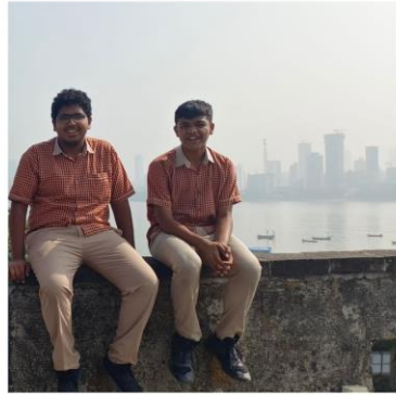
A visit to Dharavi